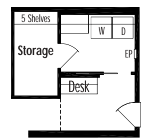
Utility Room Option KWU3 Desk with Lap Drawer and 48" Wall Cabinet (A and B Only)

Floor plan dimensions are approximate. Artist's floorplans, elevation renderings and photographs are for illustration purposes only and may include optional features. Garages, porches and other attachments are not included unless specified in the written contract. All construction details and specifications must be written in the contract. No oral conditions.