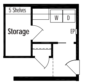
Utility Room Option KWU1 Hall Closet (A and B Only)